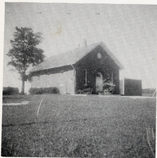
(BUILT IN 1866)