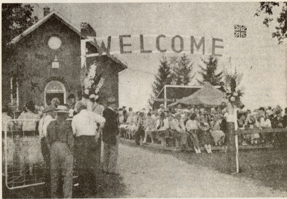
The welcome sign was hung out for the two-day reunion. Part of the crowd of 400 is shown here beside the one-room red brick schoolhouse of SS 7 West Zorra. Several pupils and one teacher who remembered the school as it stood at the turn of the century attended the event.

A collection of old photographs of groups of former pupils and teachers, dating back, many years before the turn of the century had been collected from the neighborhood's treasury of "albums" and were on display.